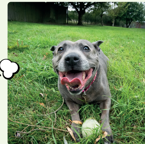
Names have been changed to protect confidentiality.