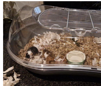
Neutral space method

There are a couple of different mixing methods you can try: