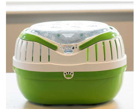
Carrier or Small Space method